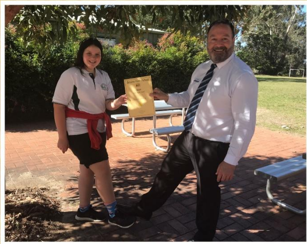
Our First Gold Award Winners for 2020