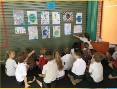
Students casting their votes to decide on the winning entries in each stage.