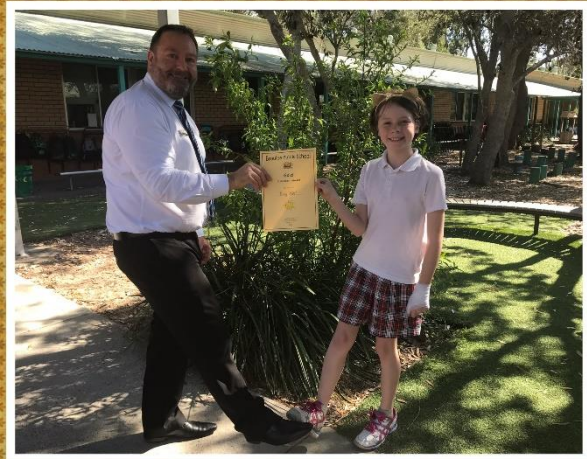
Our First Gold Award Winners for 2020